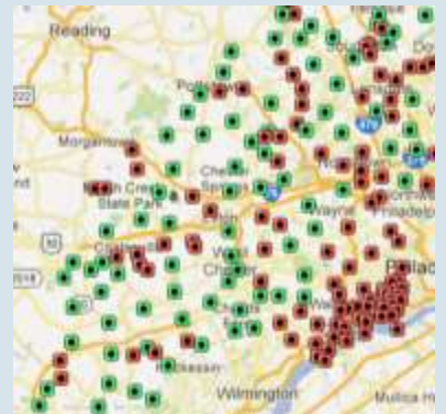
Map of Southeastern PA Highlighting in Red Municipalities with POS